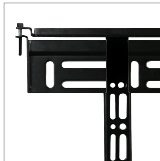
Patented 'Torsion-Lock' security helps prevent un-authorized removal of the screen