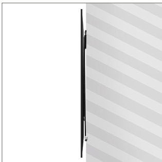
Ultra-slim design mounts screens only 14mm from the wall