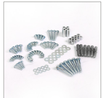
All mounting hardware included