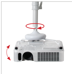
Ball joint adjustment for easy positioning of projector