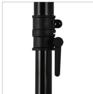
Hand lever for easy adjustment of ceiling drop