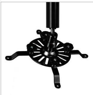
'Carousel' mounting plate for universal compatibility