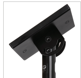
Ideal for angled or cathedral ceilings