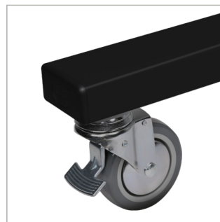
Includes non-marking 4" locking/braked castors