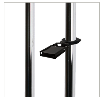
Collar compatible accessories can be fitted to the poles