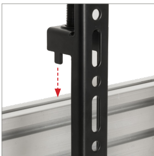
Simple 'hook-on' installation