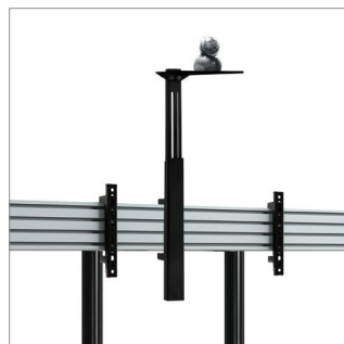
VC shelf can mount camera above or below the screens